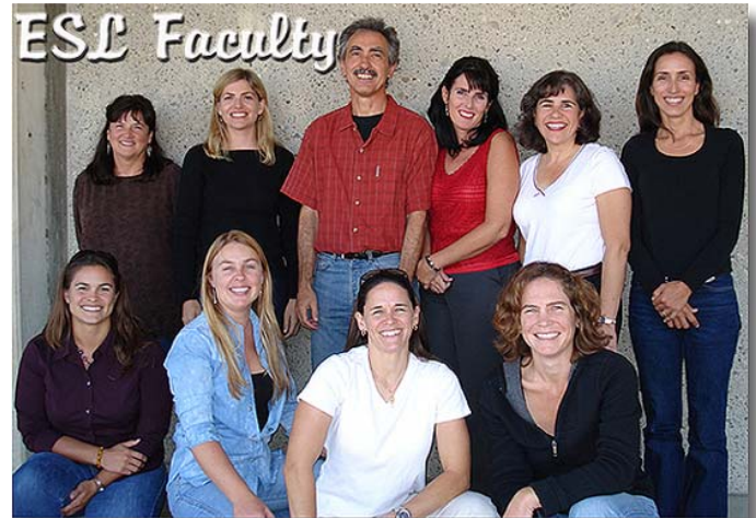
The ESL program also provides classes at Arroyo Grande High School. Improve your future by improving your English skills at Cuesta College.

In addition to six course levels, Cuesta also provides ESL language laboratories. These laboratories come equipped with computers & printers, audio & video players, and listening, reading, & pronunciation materials. In addition, ESL tutors also conduct small groups and one-to-one instruction as part of the lab.